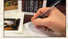
Card ministries page 4