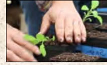
Greenhouse opening page 3