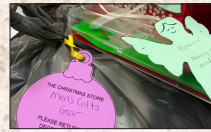
Angel Tree & layette items page 3