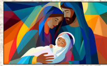
Christmas Eve page 2