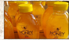
Winter goods at Teter page 4

WEB & EMAIL addresses are hot-linked. Just click them!